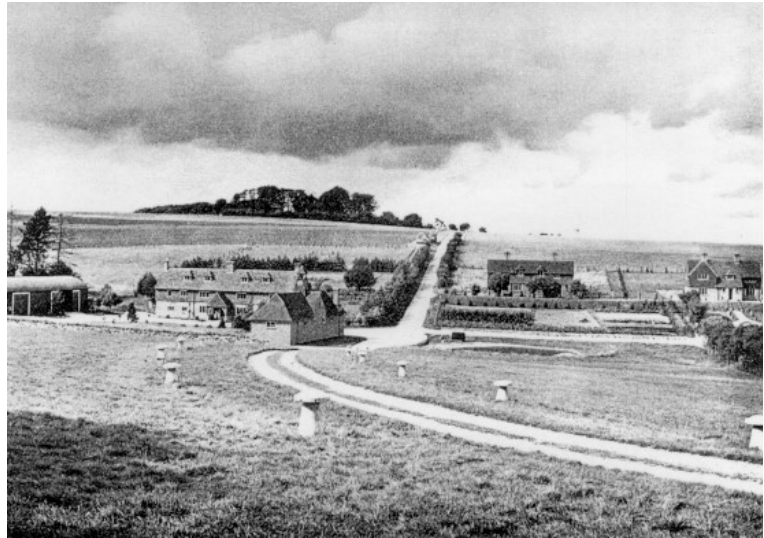
Freemantle Park farm, photographed in 1936

Of Freemantle Park farm we can give a more detailed description, thanks to the survival of a 1936 sale catalogue. Although improvements had been made since Victorian times, including the construction of garages for several cars and even an aeroplane landing ground of about 800 x 300 yards, much of the farm appeared to have changed little over the period. The farmhouse was approached from Hannington village by a carriage drive on the south side, with a spur leading to a broad gravelled terrace in front of the residence; the drive continued beyond the residence over the Downs belonging to the estate, and gave access, on the northern boundary, to a road leading into Kingsclere. The total area of the farm was 454.352 acres, including 13 acres of woodland, 165 acres of downland (including the 100 acre Freemantle Park Down), 88 acres rough pasture, about 9 acres arable, and the remainder grassland. There were numerous well-built hunting jumps on the property (three removable oak rails). The farmhouse itself dated from about 1792, though part was older. It consisted of a lounge, hall, and two other reception rooms, eight bedrooms