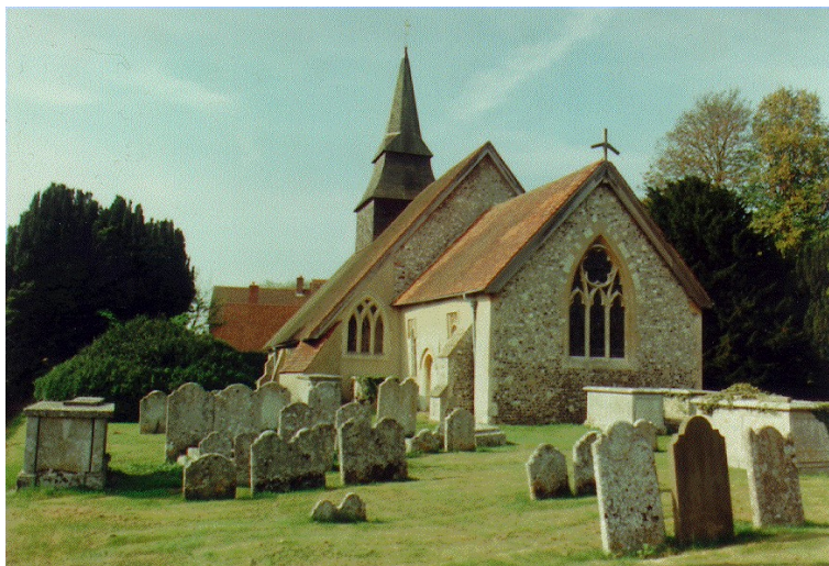
Hannington churchyard, photographed in 1997