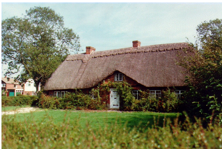
The Wythe copyhold farmhouse in Hannington, photographed in 1997