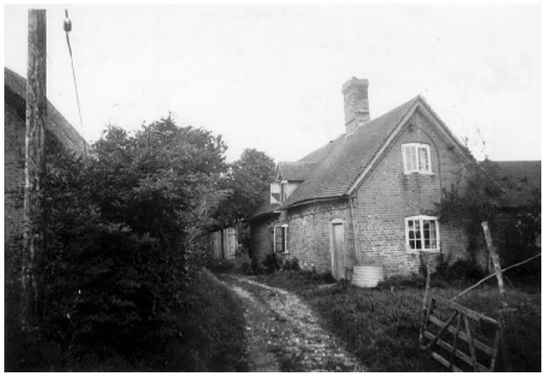
The cottage, photographed in 1948