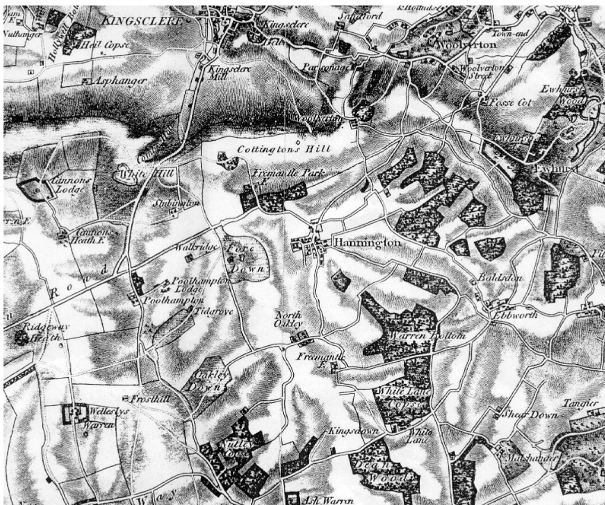
Detail from 1st edition Ordnance Survey map, 1810

The Old Series Ordnance Survey Maps of England and Wales , Vol. III. 1981, Lympe Castle, Kent