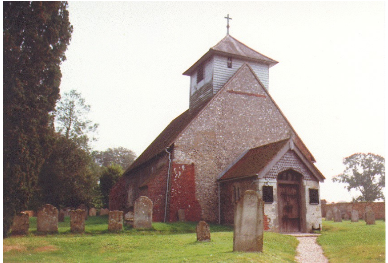
Dummer parish church, photographed in 1997